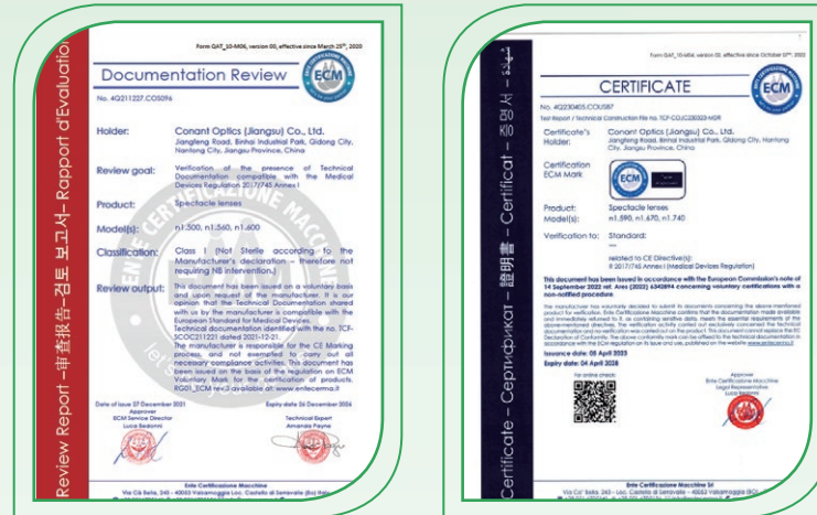
CE certification of the European Regulation