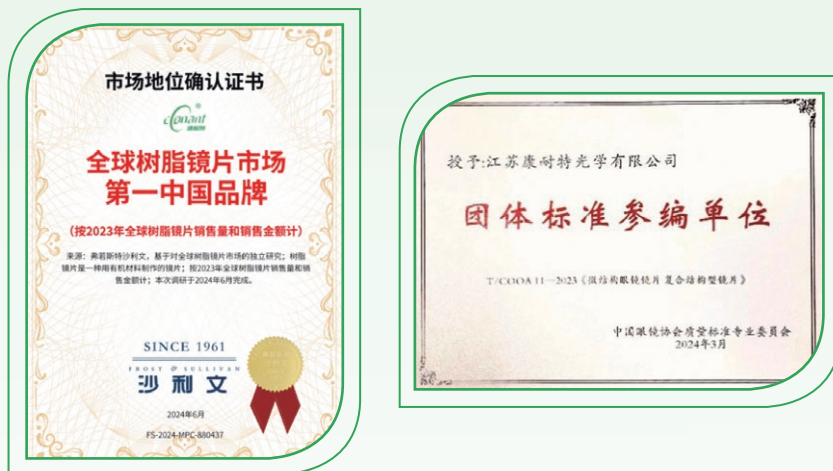
Certificate of recognition of its market position as the 'No. 1 Chinese Brand in the National Resin Lens Market' (Left) and 'Compiling Unit for Group Standard' (Right)

During the Year, the Group was honored to receive a certificate of recognition of its market position as the 'No. 1 Chinese Brand in the National Resin Lens Market' from Sullivan (below left). The honor was awarded by Frost & Sullivan based on an independent study of the global resin lens market, which was completed in June 2024 based on the global sales volume and sales amount of resin lenses in 2023. In addition, the Specialized Committee on Quality Standards of China Optometric and Optical Association has awarded the Group the title of 'Compiling Unit for Group Standard' according to T/COOA 11 – 2023 Microstructure Ophthalmic Lenses Composite Structured Lenses (《微結構眼鏡鏡片複合結構型鏡片》) (below right). We have also been listed in the list of 'Intelligent Manufacturing Workshop in Jiangsu Province in 2024'.