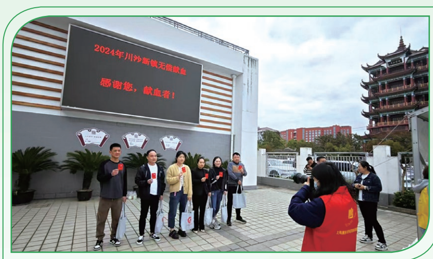
Employees Participated in 2024 Chuansha New Town Blood Donation

By creating a platform for the cultural and sports life of our employees, the Group aims to build a dynamic and creative team by organising various kinds of spare-time activities to increase mutual communication among employees and enhance team cohesion and sense of belonging. The Labor Union organises a number of activities and competitions for our employees on a regular basis and encourages them to organise their own activities. During the Year, we organised our employees to participate in the 2024 Chuansha New Town Blood Donation.