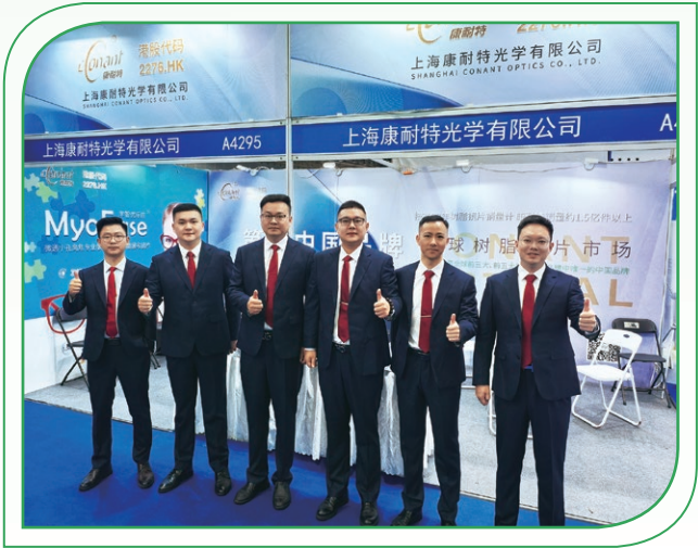
CCOS2024 Staff Photo

During 4 September to 8 September 2024, the Group participated in the 28th Congress of Chinese Ophthalmological Society (CCOS2024) organized by the Chinese Medical Association and the Chinese Ophthalmology Society in Wuhan. Through this academic congress, we demonstrated to the public a variety of self-developed and innovative products such as equal imagery lenses, FIX double curved thinning lenses and UV PLUS anti-blue light lenses, and discussed with peer experts and scholars around the hot issues in the field of ophthalmology.