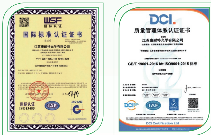
International Standard Certifications (left) and Quality Management System Certification (right)

In addition to the standard certifications of ISO13485:2016 Quality Management System for Medical Devices (《ISO13485:2016 醫療器械質量管理體系》), ISO9001:2015 Quality Management System (《ISO9001:2015 質量管理體系》) and CE certification that complies with the European Regulation 2017/745 Annex 1 – European Medical Devices Regulation (《2017/745 Annex 1 – 歐洲醫療器材法規》), we also obtained the United Kingdom Conformity Assessed (UKCA) Certificate of Compliance during the Year, some of which as shown in the following pictures. We produce our products in strict compliance with various standards of production, such as GB 39552.1-2020 Sunglasses and Sun Glare Filters Part 1: General Requirements (《GB 39552.1-2020 太陽鏡和太陽鏡片第1部分：通用要求》), QB/T 2659-2004 Spectacles for Driving (《QB/T 2659-2004 機動車駕駛員專用眼鏡》), GB/T 38005-2019 Spectacle lenses-Fundamental requirements for uncut finished lenses (《GB/T 38005-2019 眼鏡鏡片未割邊鏡片的基本要求》), etc. In accordance with the requirements under ISO13485 Quality Management System for Medical Devices (醫療器材質量管理體系), we will set monthly, quarterly or annual quality assessment items and target values, such as perfectness ratio of equipment, passing rate of measurement equipment under inspection, average monthly passing rate of random inspection, customer satisfaction, rate of customer complaints, etc. During the Year, our quality has reached the target requirement.