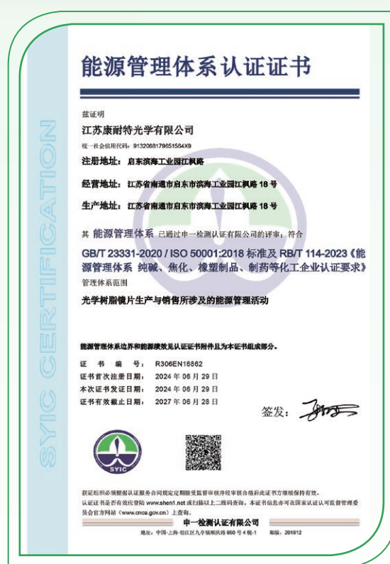
Environmental Management Systems certificate (left) and Energy Management Systems certificate (right)