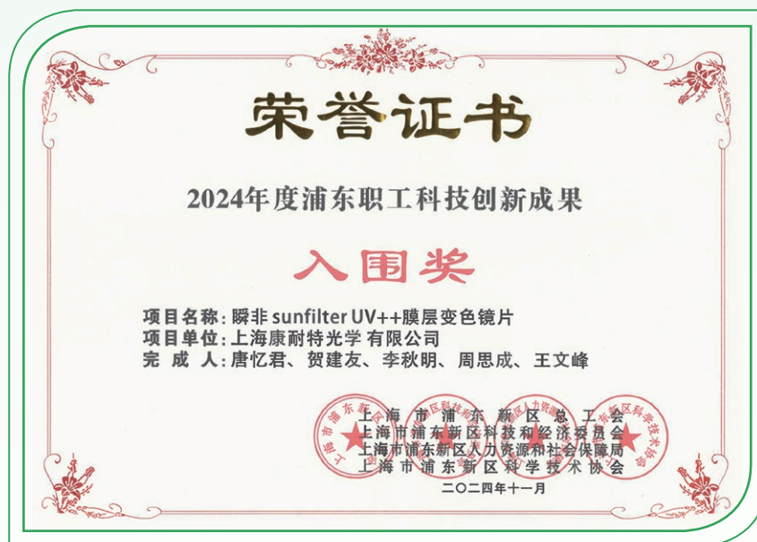
2024 Pudong Employee Technology Innovation Achievement Certificate of Honours

In addition, we encourage and support technological innovation among our employees. During the Year, five of our employees participated in the "2024 Pudong Employee Technological Innovation Achievement" competition and won the entry prize for their project, the sunfilter UV++ Film Layer Coating-Photochromic Lens (瞬非sunfilter UV++膜層變色鏡片), which praised and acknowledged their efforts in the project and served as a good motivation within the company at the same time.