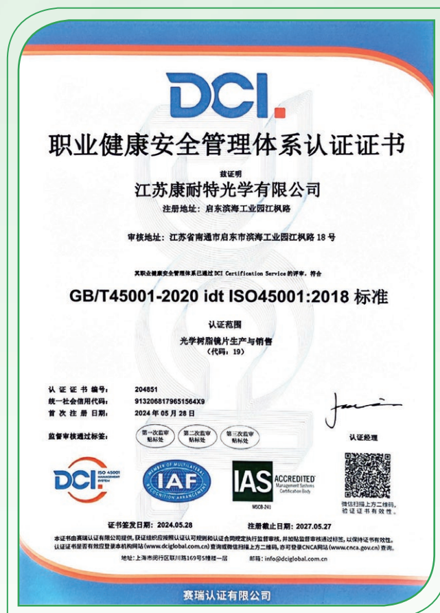
Occupational Health and Safety Management Systems Certificate

We request all employees conduct training on safety knowledge and safe operation during onboarding, and examine their understanding of the safety knowledge and safety regulations. Safety education focuses on two aspects, namely fire safety and labour safety and health. We also organise regular fire safety training and evacuation drills to ensure that our employees can properly master the use of the fire extinguishers and keep in mind the escape routes in the event of an emergency. During the Year, the Group sent its employees to participate in the mini fire station competition in Qidong City. Through this exercise, we had the opportunity to review the work of the Group's micro fire station and greatly enhanced our fire safety preparedness drills in the future.