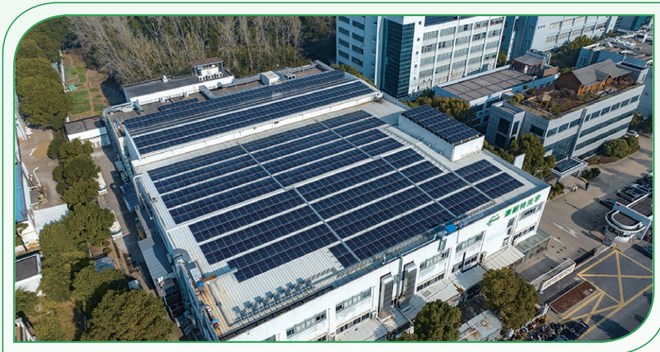
Production Bases with the Incorporation of Distributed Photovoltaic Energy Generation Systems

In addition, by converting water heating to electricity energy consumption, we supplied 9,844 tonnes of 60°C hot water to the production system during the Year, resulting in cumulative electricity cost savings of approximately RMB472,500, which not only saves expenses on electricity, but also reduces greenhouse gas emissions and contributes to sustainable development.