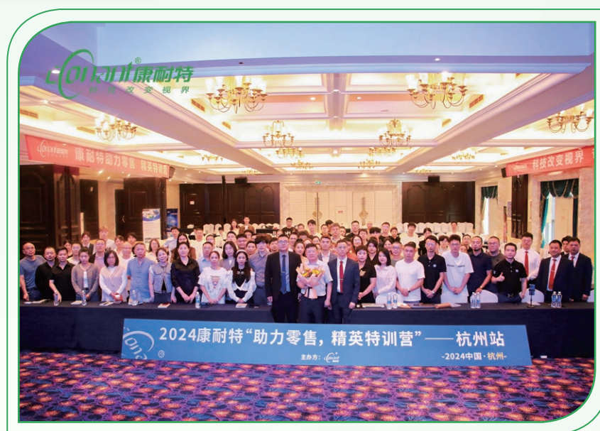
"Power Retail, Elite Training Camp – Hangzhou"

On 26 September 2024, we held a 2-day Power Retail Sales Elite Training Camp in Hangzhou. We invited a professor of ophthalmology from Sun Yat-sen University and a marketing manager of Mitsui Chemicals' lifestyle and healthcare materials, together with our professional training team, to bring a wide range of specialised courses to our employees. At the end of the training session, we held an award ceremony for the outstanding trainees and presented them with certificates and gifts.