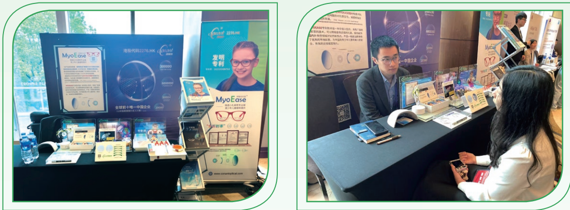
The 3rd Yangtze River Delta Eyes Health Congress

6 June 2024 was the 29th Sight Day. As one of the world's leading resin lenses manufacturers with a wide range of products, the Group has brought a number of patented products and participated in the 3rd Yangtze River Delta Eye Health Congress organized by the Yangtze River Delta Coordination Committee-Smart Healthcare Development Alliance and the Shanghai Preventive Medicine Association. At the congress, our staffs introduced our products and the transformation of scientific research results to customers, aiming to provide better visual solutions and enhance the public's awareness of eye care.