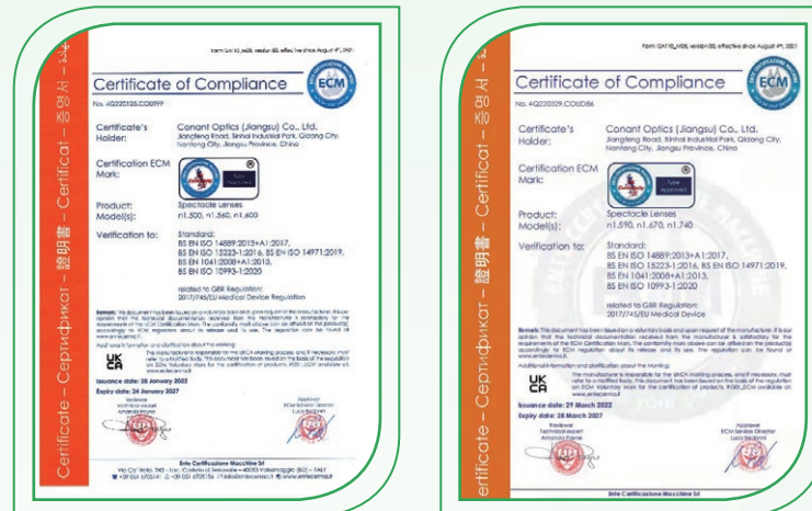
UKCA Certificate of Compliance