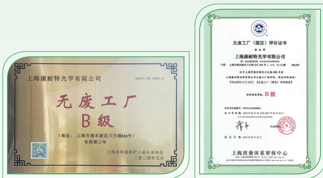
Evaluation Certificates of Waste-Free Factory (Park) – Grade B (無廢工廠(園區)B級)

For the Year, after the comprehensive assessment and expert evaluation by the Profession Association of Environmental Protection Industry of Shanghai and the Shanghai Quality System Audit Center, the Group was assessed as Waste-Free Factory (Park) – Grade B (無廢工廠(園區)B級) and became the first batch of “Waste-Free Factory (無廢工廠)” certified enterprises in China. We have actively embarked on green development, explored waste-free construction in the whole chain of research and development, production and sales, and coordinated the promotion of waste minimization, resource utilization and harmless management of industrial solid waste.