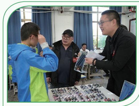
Staff Conducting Vision Screening