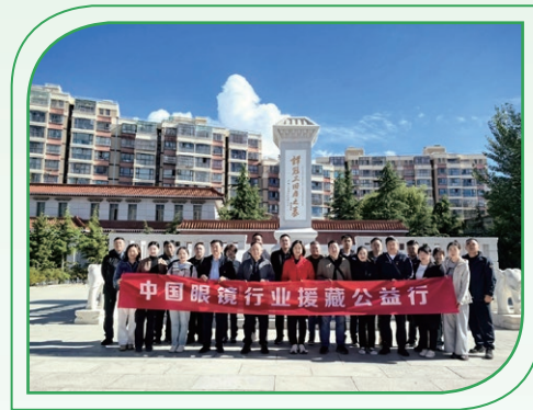
Representatives of Charity Teams and Experts in Tibet