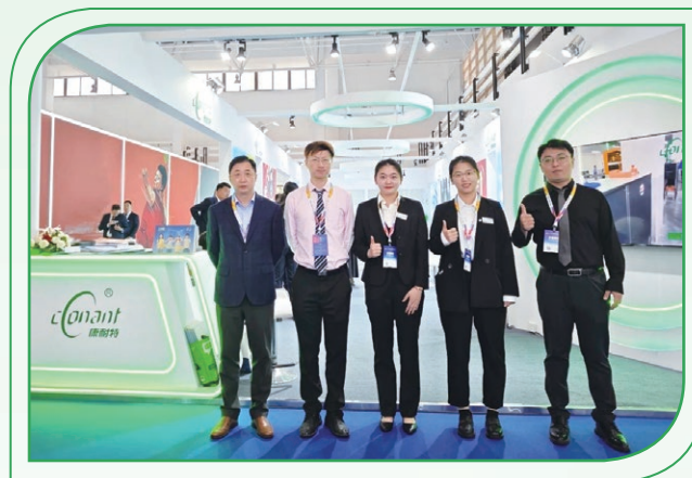
Beijing International Optics Fair Staff Photo

During 10 September to 12 September 2024, the Group participated in the 35th China (Beijing) International Optics Fair. As one of the world's leading resin lenses manufacturers with a wide range of products, we have brought a variety of self-developed products to the fair and provided one-on-one sessions to potential customers to explore new opportunities for cooperation. Looking ahead, the Group will continue to research and develop better lenses to ensure better quality.