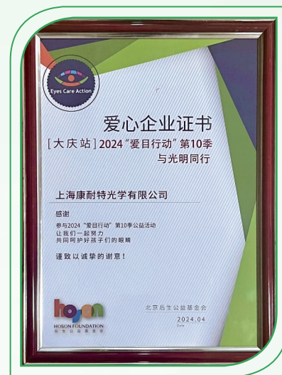
“Bright Vision Initiative” in Daqing City (「愛目行動」大慶站)